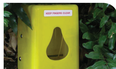
Timms Kill trap

Rural Pest Services is a skilled contractor that the Regional Council has contracted for this operation. With 20 years' experience in pest control, RPS has been part of the highly successful possum control area (PCA) programmes in rural areas. These involve a large number of Hawke's Bay farmers who are working to reduce possum damage in farm and bush areas, and increase bird life, bush and pasture health across the region. They have also worked on similar urban programmes in other parts of Hawke's Bay. Jake Bowcock of RPS can be contacted on 021 280 2988