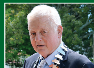
Mayor Craig Little

We need to harness what we have, grow our economy and together make Wairoa the best it can be.