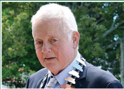
Mayor Craig Little

If you would like to have a meeting with the Mayor, call the council offices on 06 838 7309 to arrange a meeting time.