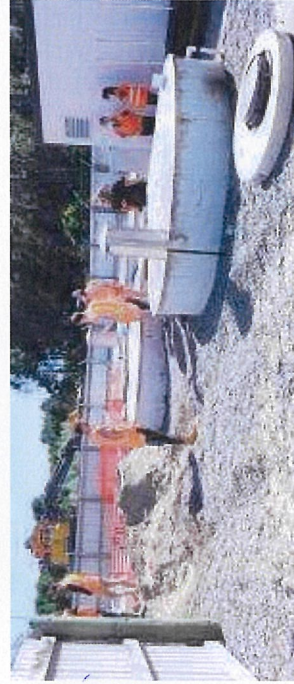
The Blue Bay wastewater treatment plant was part of the recent Council visit. A temporary system is in place while the upgrade work is being carried out. The infrastructure upgrade is environmentally anchored and future-proofed against the summertime population increase, including the full development of the Blue Bay subdivision.

Our Wairoa District Council team is focussing on the now and ensuring our services within the three waters space are operating at the highest level they possibly can - and through the additional funding ensuring we are improving our infrastructure and delivery wherever possible.