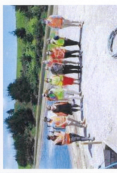
In town at the Wairoa wastewater plant where around $3 million of the Government's national three waters stimulus funding has been invested to improve infrastructure and processes.

Wairoa District Council Queen St, Wairoa info@wairoad.c.govt.nz (06) 838 7309