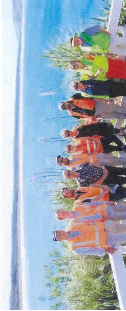
Contractors, staff and elected members enjoyed the beautiful view across Blue Bay, Opoutama.