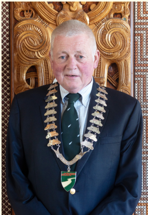
Mayor Craig Little