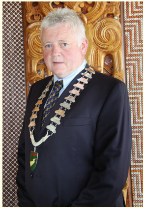
Mayor Craig Little

It is an exciting time to be part of the Wairoa District Council.