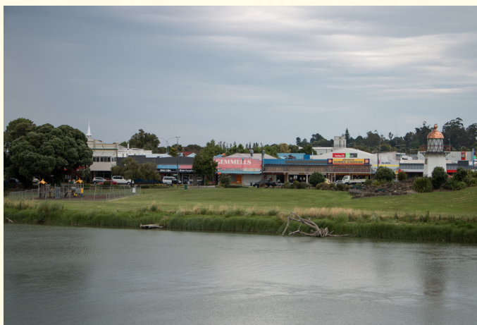
Wairoa's CBD taken from the North Clyde side of the town