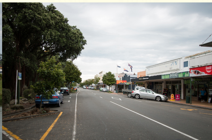
What are your thoughts on Wairoa's CBD? Let us know your thoughts