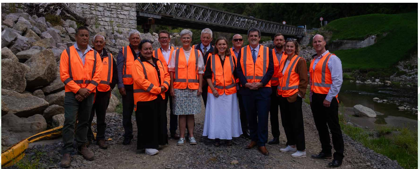
Transport Minister Chris Bishop confirmed the Waikare Gorge realignment project at the Waikare Bailey Bridge - two years after Cyclone Gabrielle destroyed the bridge and closed SH2 for three months.

The existing Bailey bridge will remain in place until the realignment is built. The Bailey bridge will follow a routine maintenance schedule with regular monitoring to ensure it remains safe and fit for purpose.