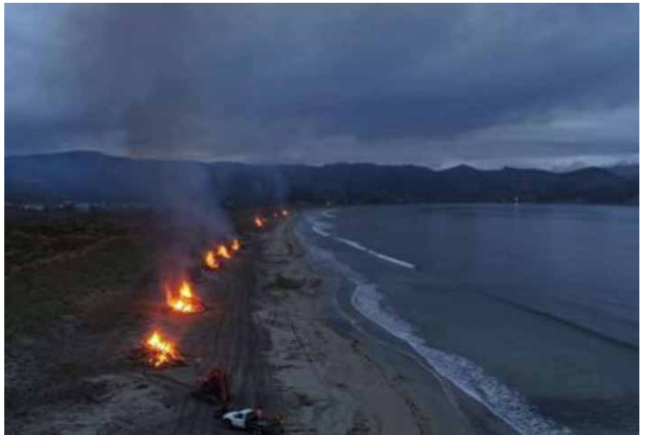
Woody debris burn piles along the coastline between Mahia and Opoutama.

For an insight into the Wairoa Woody debris clean up, have a watch of this video outlining the local partnerships which have helped make the clean up successful: https://youtu.be/52ijA7Nxhpk