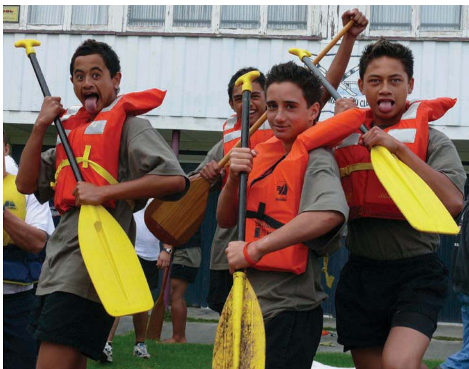
Faces of the future - your opinions today will pave the way forward for the community.

proposal, so if anyone wishes to express an opinion, they can fill in the form and return it to Council. Two public information meetings took place earlier this week – one at Mahia and one at Wairoa. The other important issue currently