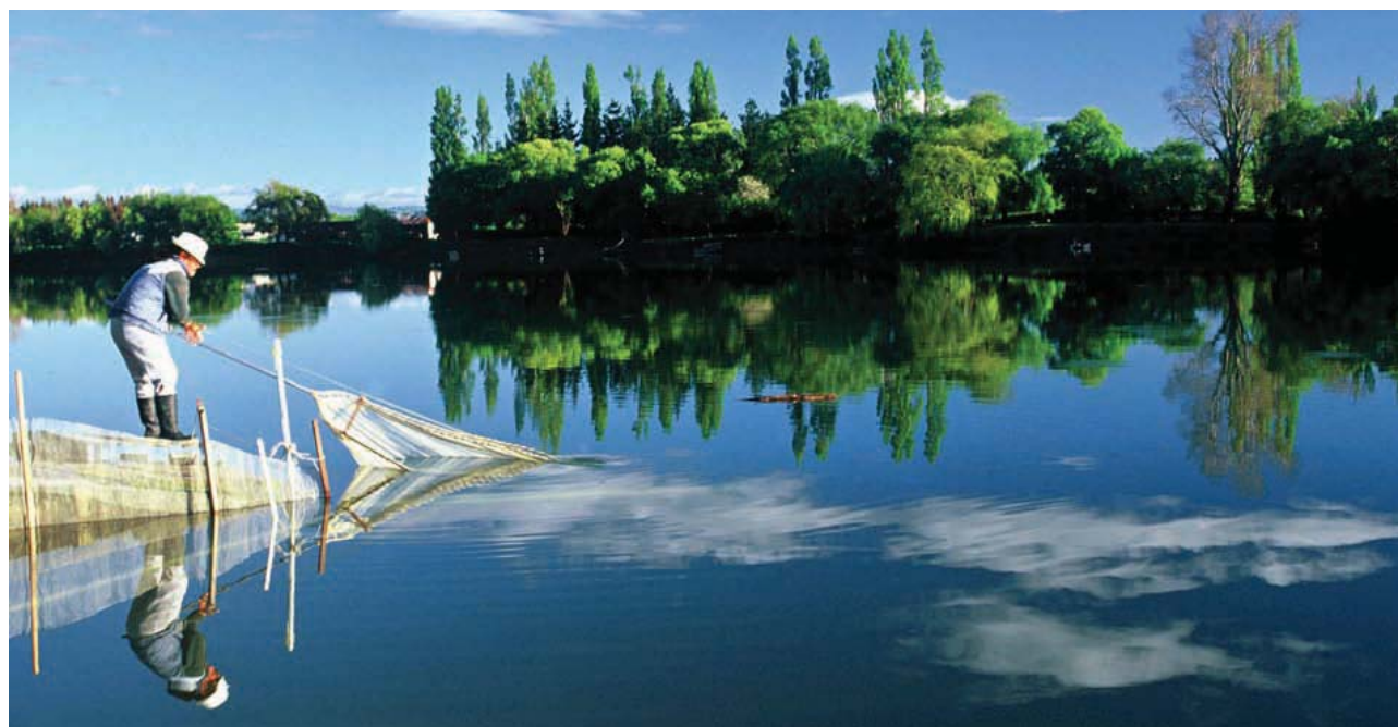
Heart of the community ... committed to making the district a place for all to enjoy.

Your views are important to the council team, so you are encouraged to make use of the varied points of contact available for enquiries or submissions, including phone (838 7309), email via the website ( www.wairoadc.govt.nz ), or by calling in to the Council administration offices on Queen Street.