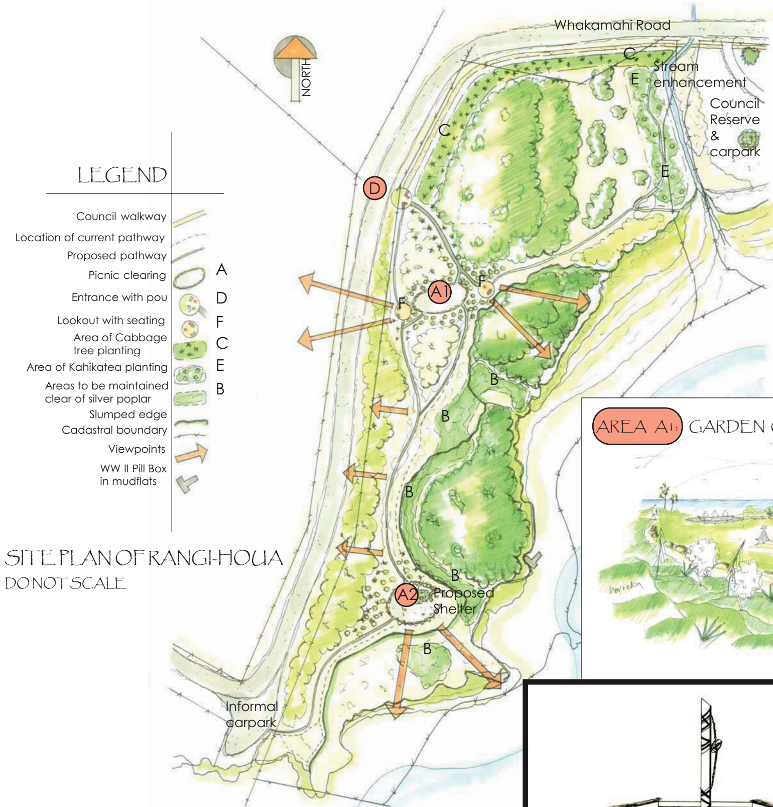
SITE PLAN OF RANGI-HOUA DO NOT SCALE

To celebrate the former garden that was known to have been present on the top flat terrace in the early Rangihoua pa site, it is proposed to plant the area surrounding this clearing with native plants that are now rare in this area and would have once been abundant. At each end of this northern of the two clearings, there is a raised platform area with seating for people to enjoy the stunning views. The clearings will be surrounded by round smooth limestone boulders.